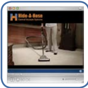
Watch the Video See how easy it works! www.hideahose.biz