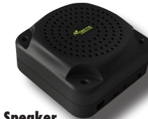
Speaker for C1050