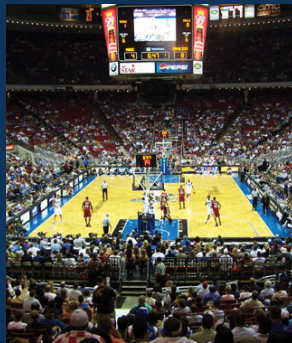
Sports Team/ Fan Travel