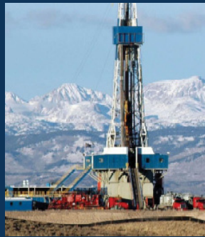
Project Travel/ Shuttle