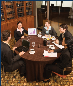
Corporate Travel/ Shuttle